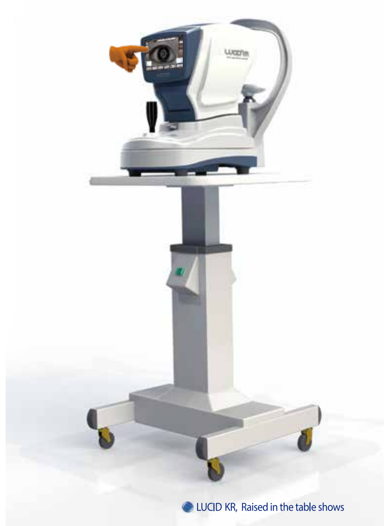
LUCID`KR, Raised in the table shows

LUCID`KR provides the patients with the comfortable measuring environment by adopting Chin-rest and Head-rest with soft material of silicon rubber.