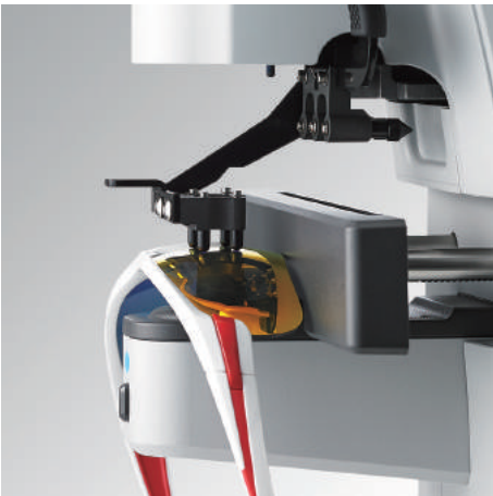
Mirror Lens Measurement