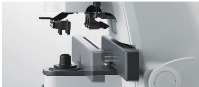
Minimize the Distance between PD Bar and Lens Support